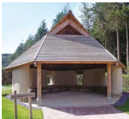
The Pilkington Cob Shelter

For an alternative format of this brochure, please call 01805 626819 or email: schoolsrosemoor@rhs.org.uk