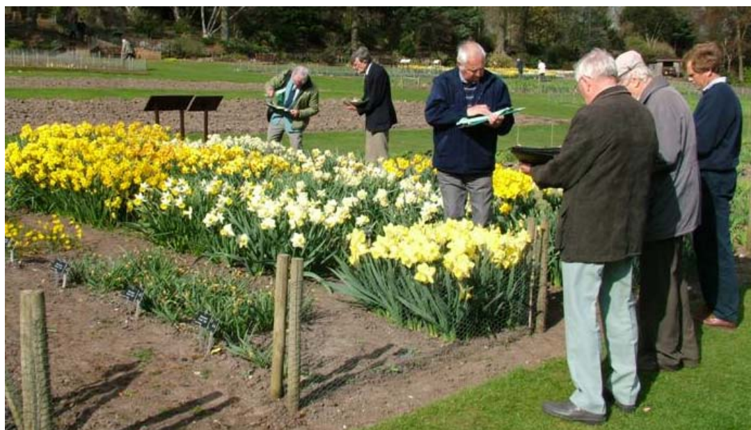
7 April 2009 Trials Assessment Panel meeting

Entries were examined for virus each spring and affected bulbs removed. Some bulbs were also removed due to basal rot and neck rot.